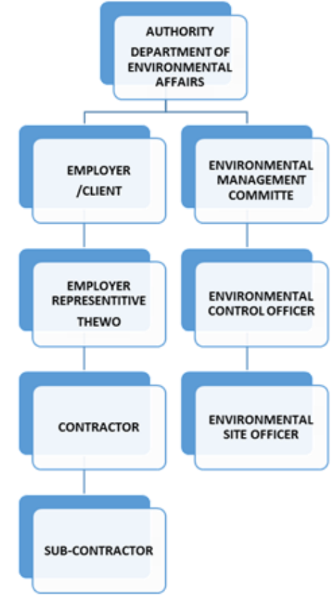
Figure 1: EMP implementation organisational structure.