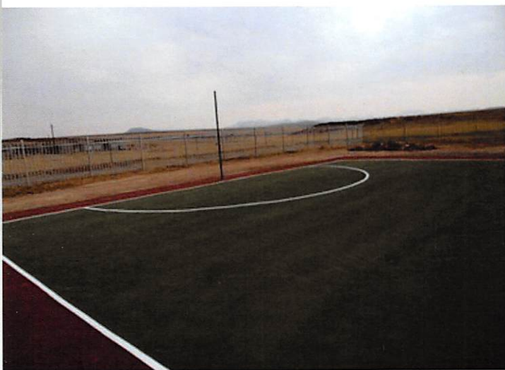
Naledi and Gcina Sportsfield