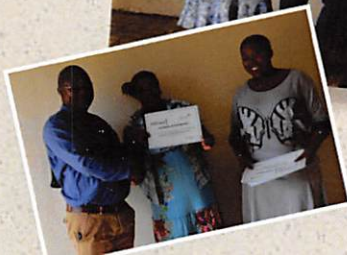
Left: A Certificate awarded to one of the participants of the Petco training