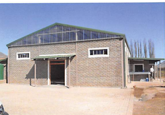
Community Hall constructed in Ward 16