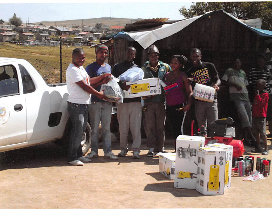
A municipality official handing over car wash cleaning materials and equipment to the youth running the car wash in Barkly East.