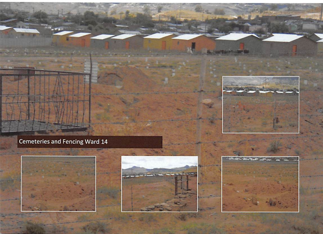
Cemeteries and Fencing Ward 14