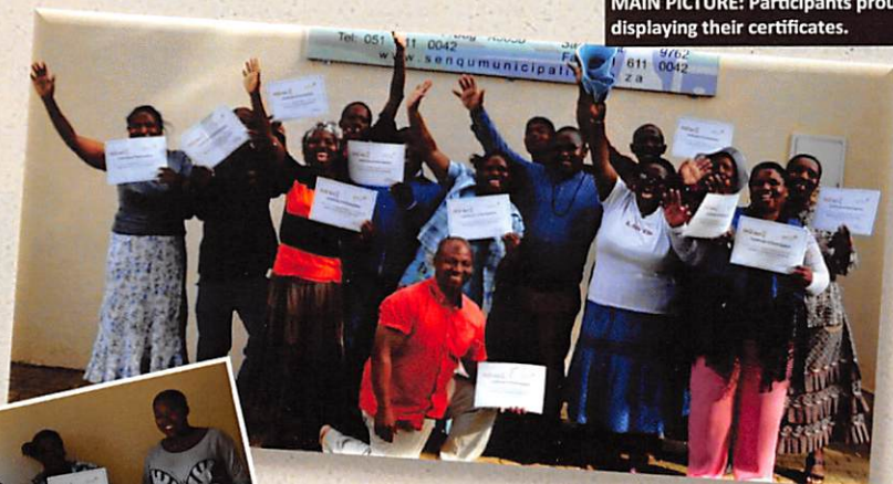
MAIN PICTURE: Participants proudly displaying their certificates.