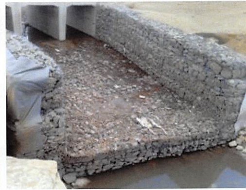
Ward 02 Tank 23 August 2012