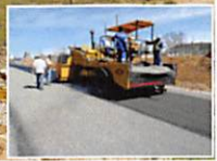
Mmusong surface road construction