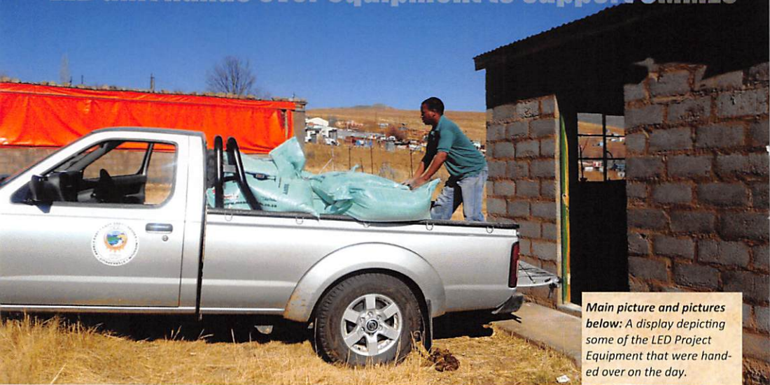
Main picture and pictures below: A display depicting some of the LED Project Equipment that were handed over on the day.

The LED Unit of the municipality donated essential equipment for projects and SME's within the various wards of Senqu. In total 21 projects were supported this financial year. The handover of the equipment was done on 19 June 2015 at the Bhunga Hall in Sterkspruit.