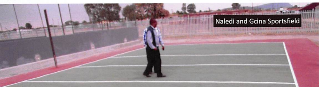
Naledi and Gcina Sportsfield