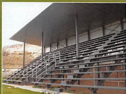
Upgrading of sportsfield in Lady Grey and Barkly East