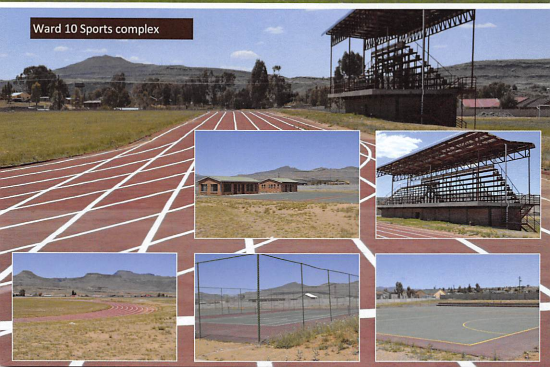
Ward 10 Sports complex